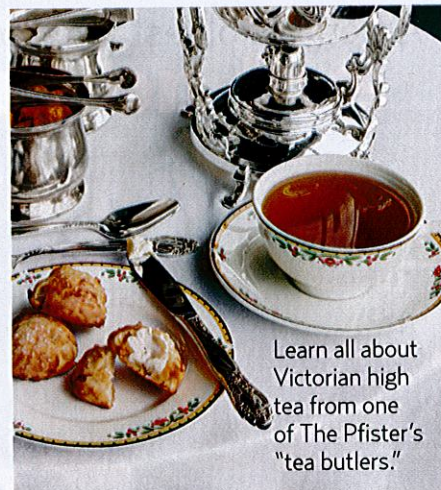
Learn all about Victorian high tea from one of The Pfister’s “tea butlers.”