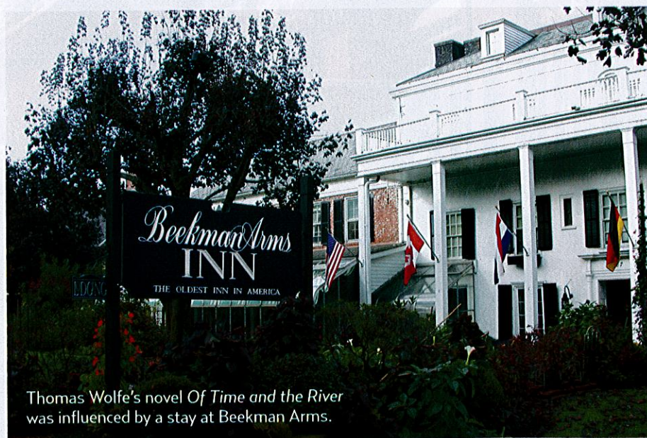
Thomas Wolfe’s novel Of Time and the River was influenced by a stay at Beekman Arms.

RATES From $145 ( beekmandelamaterinn.com )